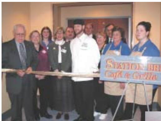
The ribbon cutting for the new Station Break Café & Grille signaled the start of preparations for the 2 nd floor project.

time," Smith concluded. Work on the approximately $15 million project is expected to start in the spring of 2007 and continue into 2008.