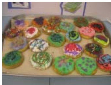
"Edible Cells" cookie frosting Lab activity is always a favorite.

get something out of the activities and genuinely appreciated our staff's involvement and time. MASH Camp is an ambitious program that wouldn't happen without the great support of our organization.